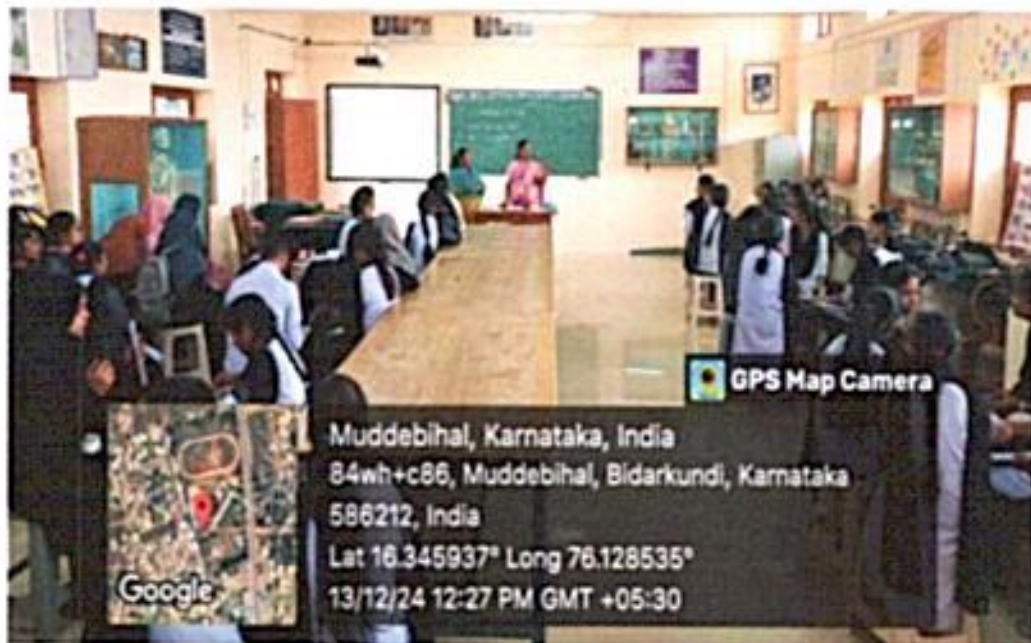
Participation of staff and students in the programme