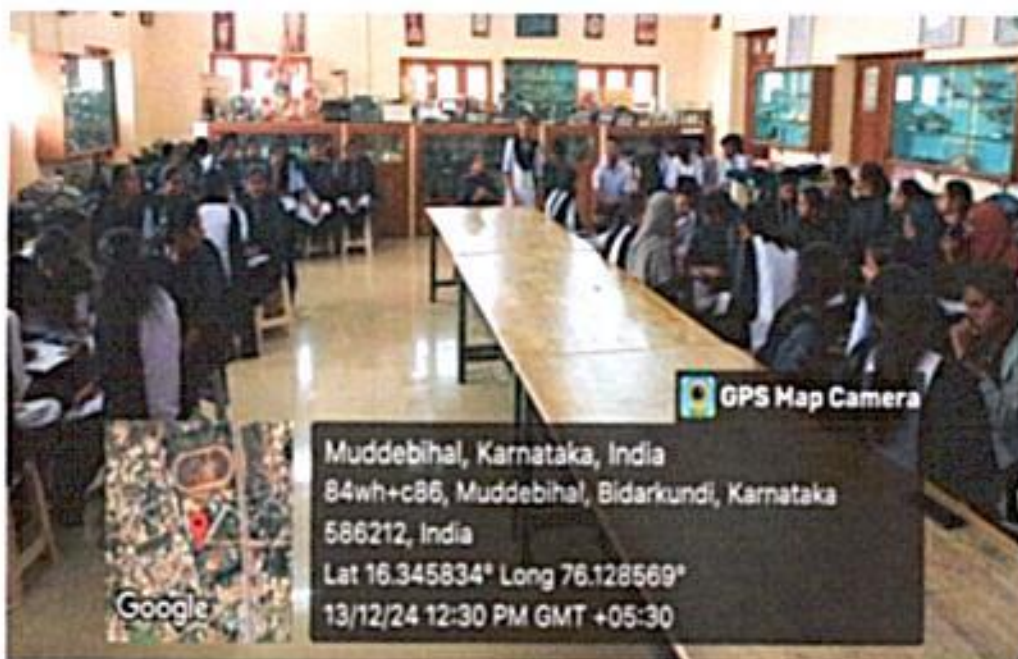
Student speaking about topic